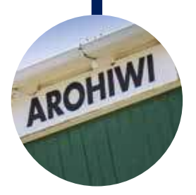
January 2015 Full ownership of Arohiwi Station