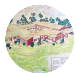
28 July 1975 A new purpose-built Hillsbrook building opens