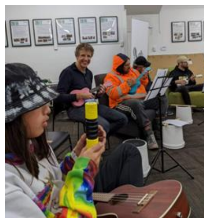
Chamber Music Team