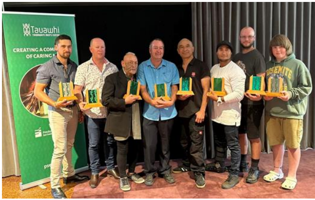
Some of our Tairawhiti Men of the Year