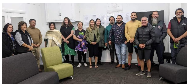
Mental Health Foundation – Chur Bro! Project team