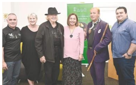
Minister Davidson visit