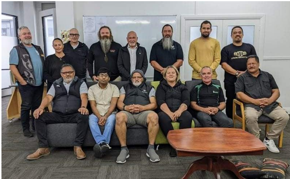
Team Tauawhi - start of 2022